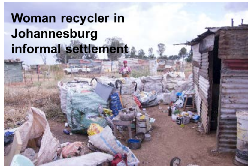
Woman recycler in Johannesburg informal settlement