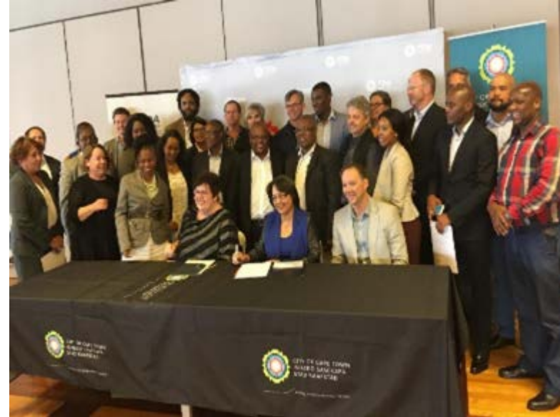
Building social housing partnerships with Metros