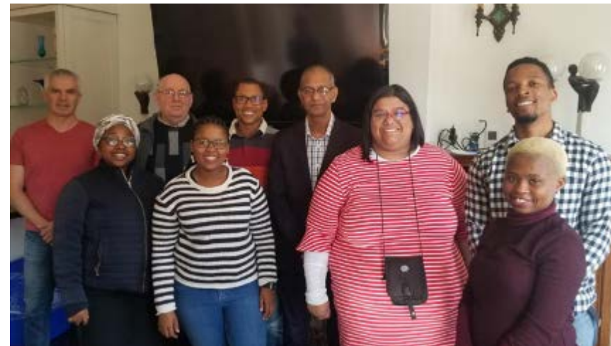
SA study visitors at the Fred Victor Centre, Toronto, March 2019