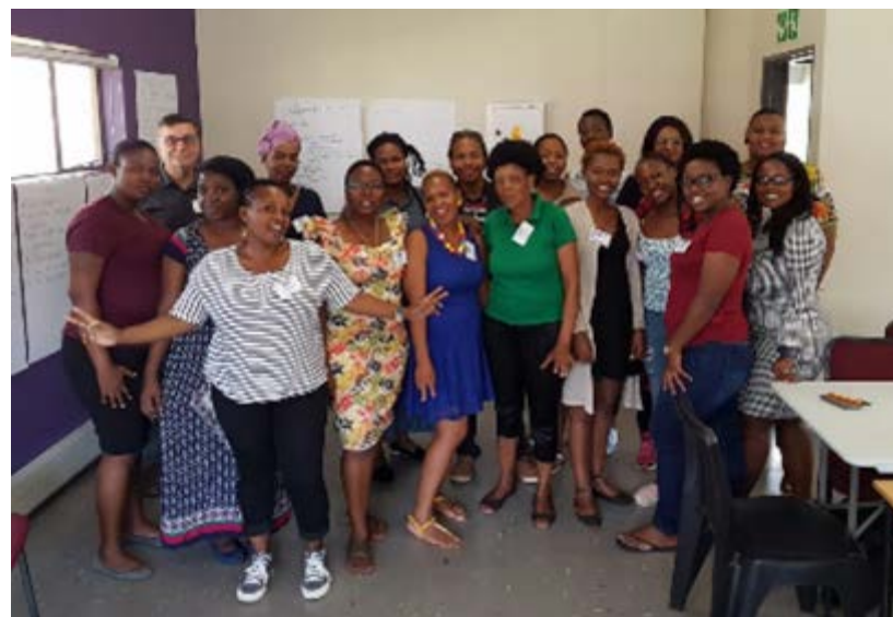
Training on GBV for SHIs