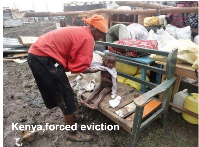
Kenya, forced eviction

Sustainable responses must be developed with governments, CSOs, women's groups, communities and the private sector.