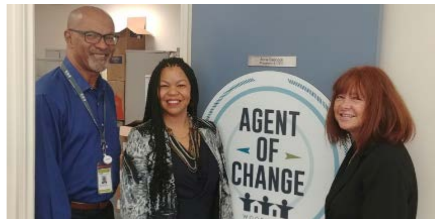
Learning exchange to Ontario for South African women social housing managers