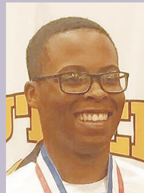
CARVIS South Mississippi Housing and Development Corp and Mississippi Regional Housing Authority No. VIII