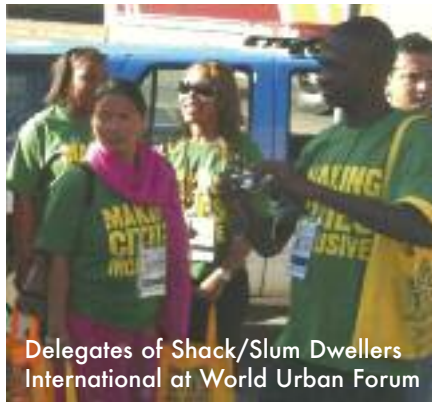
Delegates of Shack/Slum Dwellers International at World Urban Forum