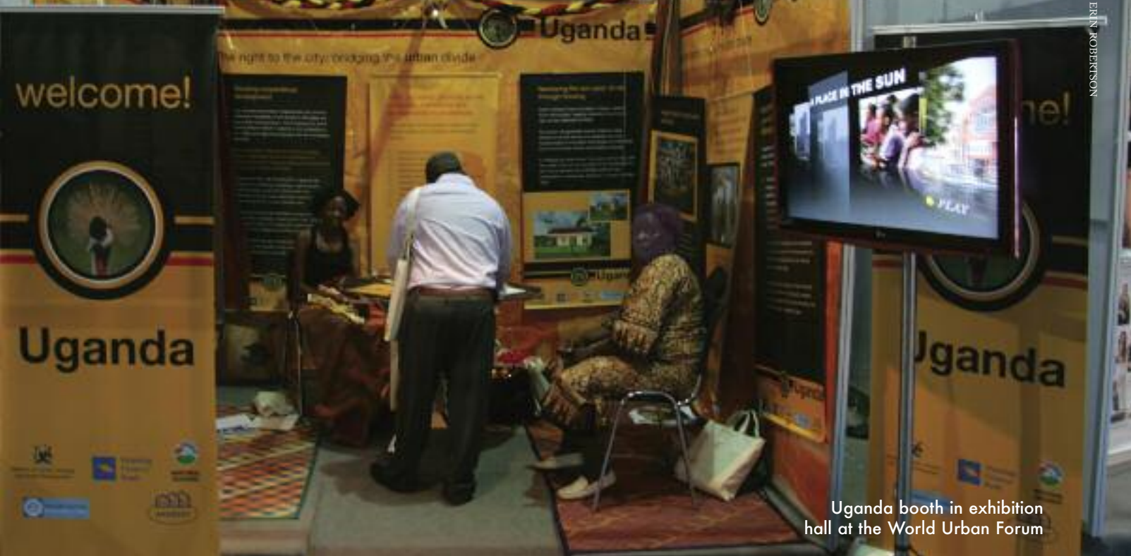
Uganda booth in exhibition hall at the World Urban Forum

The session also addressed the practical challenges of reconstruction in Haiti. Participants learned that soon after emergency assistance began arriving, attention quickly turned to effective rubble disposal. Much of the rubble was initially pushed aside, often landing in creeks and drainage areas, which would compound flooding during the rainy season. The discussion focused on a different strategy for redevelopment, one that encouraged a shift of economic and physical development outside of the capital city. Representatives of donor foundations and nations are making long term commitments to assist the government, which had just begun to institute necessary improvements prior to the earthquake, to rebuild governance, infrastructure, housing, education and a stronger economic base.