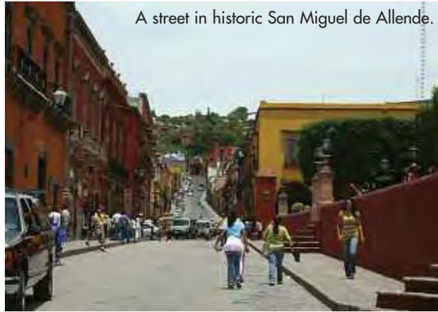
A street in historic San Miguel de Allende.

Irapuato. While units are still under construction, the completed development is expected to provide housing for 815 families. 14 The concrete slab homes are part of a planned development with paved streets and sidewalks. Due to the lack of a pressurized municipal waterworks, these units, like most new housing in the region, feature roof-mounted water tanks that use gravity to provide water pressure. This is the traditional potable water distribution system nationwide.