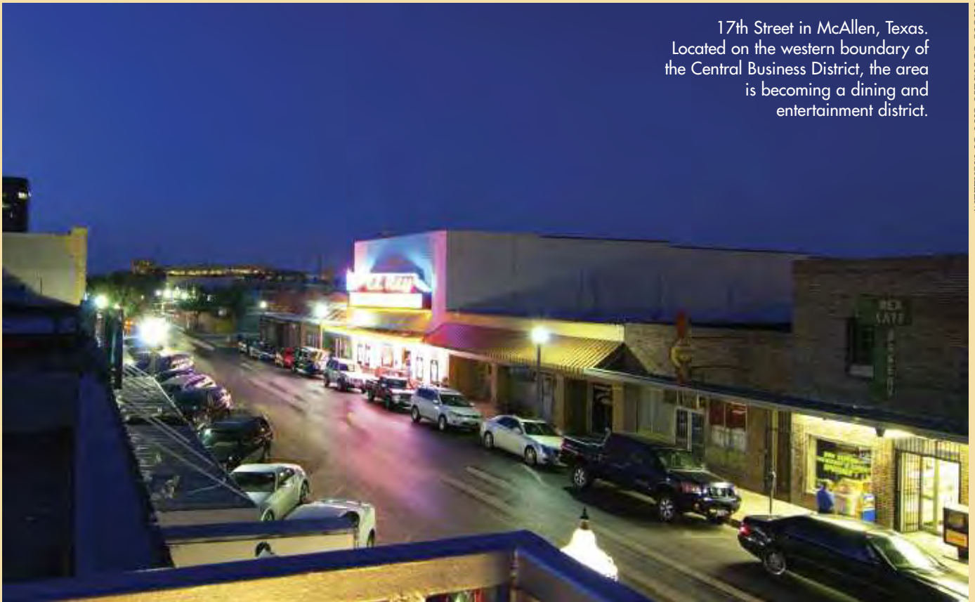
17th Street in McAllen, Texas. Located on the western boundary of the Central Business District, the area is becoming a dining and entertainment district.

Irapuato was one of the primary beneficiaries of the Friendship Caravans. This relationship, formalized through the Sister-City Program, continues 45 years later. Irapuato's long-term relationship with the City of McAllen has fostered many business, cultural, educational and personal exchanges.